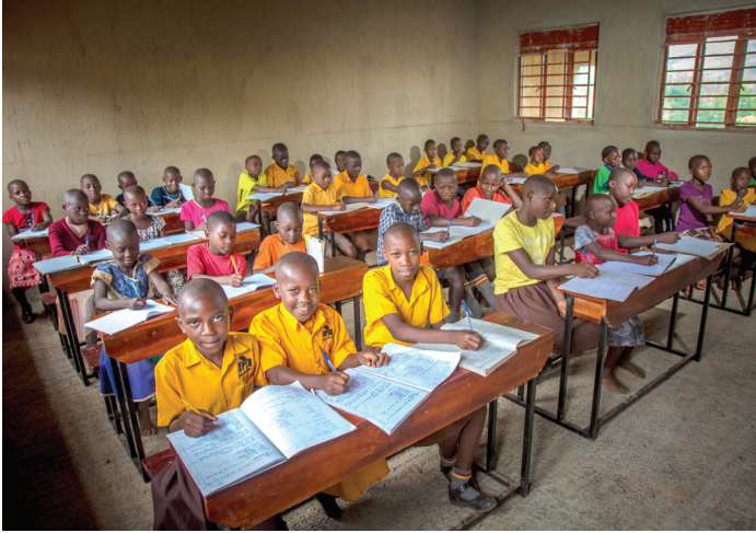
Children having class