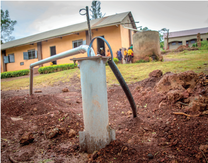
New clean water source installed.