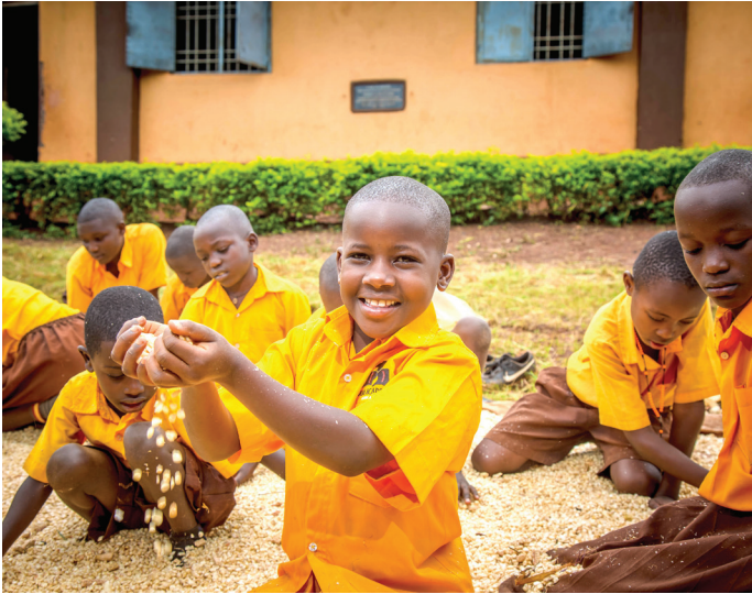
Maize Harvest for porridge.