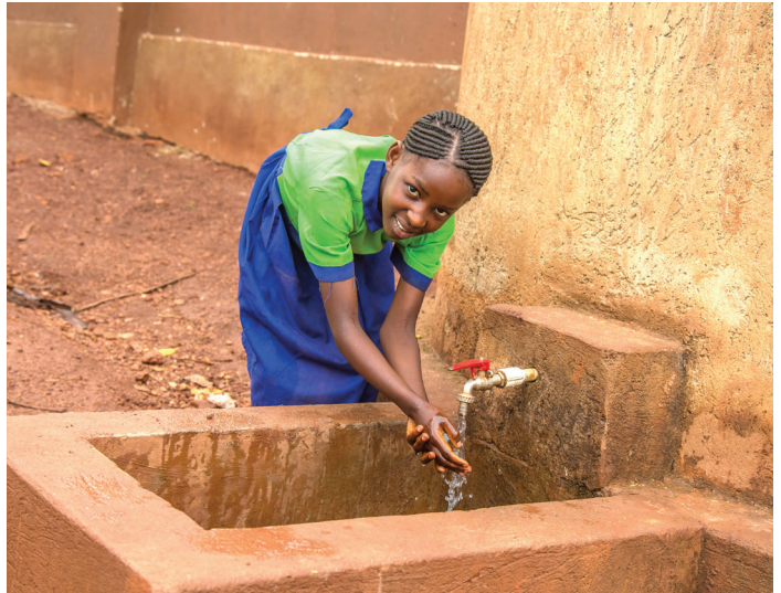
New water tank installed.