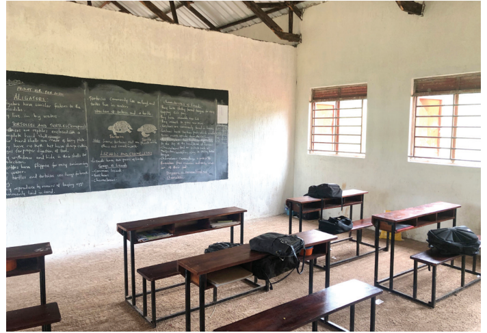
Inside our new classroom