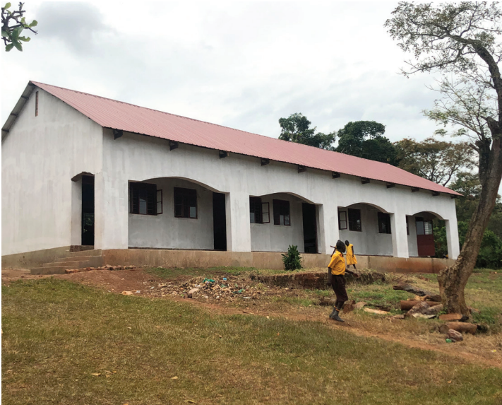
New Classroom Block 1