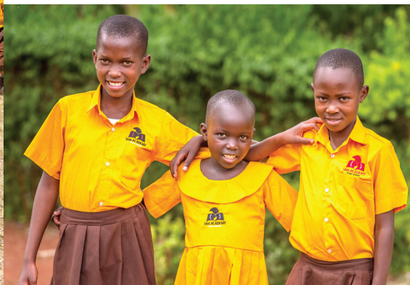
New Uniforms, New. Smiles.