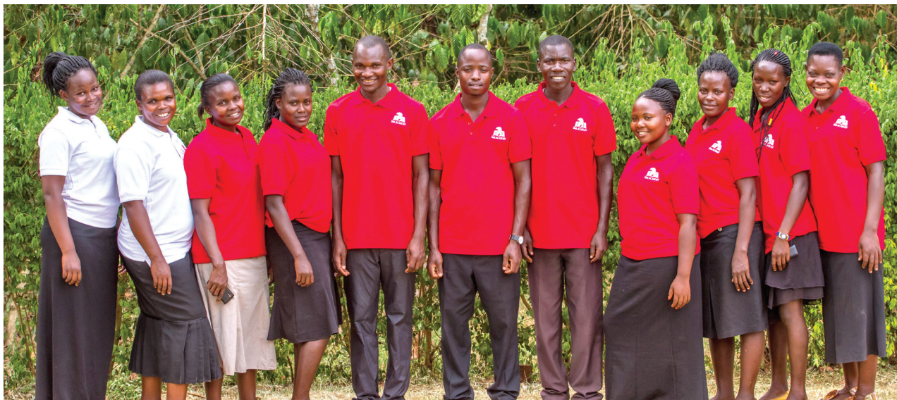
Teaching Staff for Wabinyira.