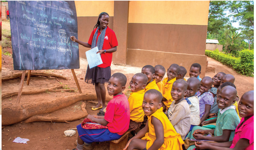
Kids taking classes outside.