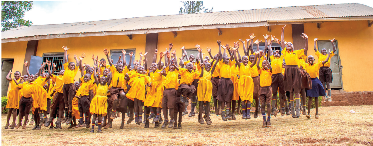
Our Students at Wabinyira school.