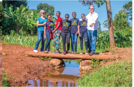
Opening a new classroom Block.