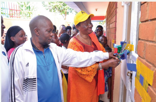
Opening Day of I Am Academy Kampala.