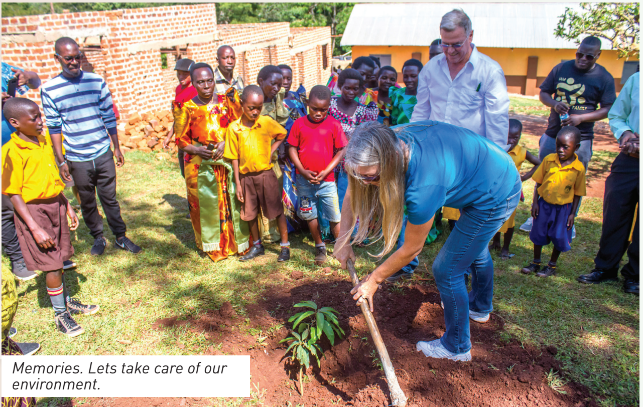
Memories. Lets take care of our environment.