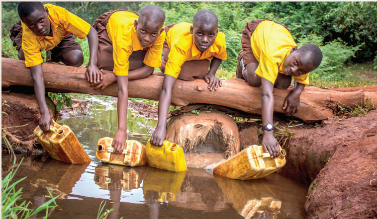
Clean water is urgently needed at the Wabinyira School.