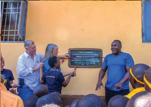
Opening a new classroom Block.